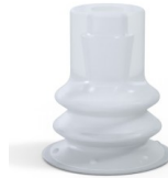
Variant reference: 96 15SLT A