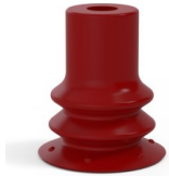
Variant reference: 96 15SL A