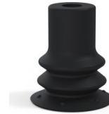
Variant reference: 96 15NI A