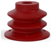
Variant reference: 96 52SL A