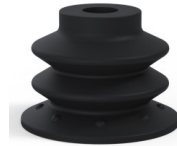
Variant reference: 96 35NI M18D-4