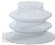
Variant reference: 96 52SLT A