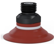
Variant reference: 9 40SL 14D-2-GIC