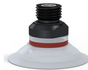
Variant reference: 9 40SLT 14D-2-GIC