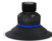
Variant reference: 9 40NI 14D-2-GIC