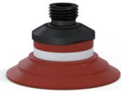
Variant reference: 9 50SL 14D-2