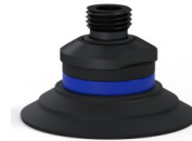
Variant reference: 9 50NI 14D-2