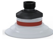
Variant reference: 9 50SLT 14D-2