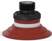
Variant reference: 9 50SL 38D-2-F