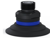
Variant reference: 9 50NI 38D-2-F