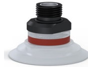
Variant reference: 9 50SLT 38D-2-F