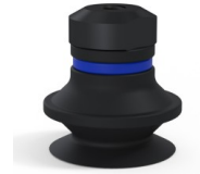
Variant reference: 91 20NI FM5GIC