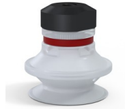
Variant reference: 91 20SLT FM5GIC