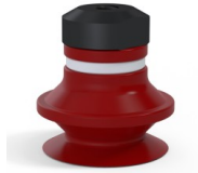
Variant reference: 91 20SL FM5GIC