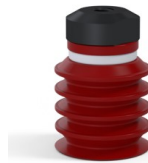
Variant reference: 92 20SL FM5