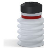
Variant reference: 92 20SLT FM5