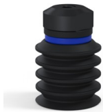
Variant reference: 92 20NI FM5