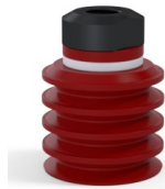
Variant reference: 92 30SL 18D-2