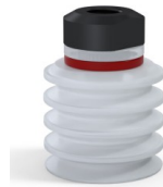
Variant reference: 92 30SLT 18D-2