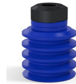
Variant reference: 92 30SLBLEU 18D-2