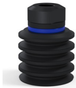
Variant reference: 92 30NI 18D-2