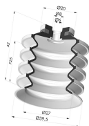
Bellows Suction Cup 4.5 folds Series 92, Ø 40 mm