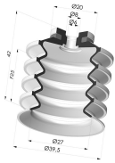
Bellows Suction Cup 4.5 folds Series 92, Ø 40 mm