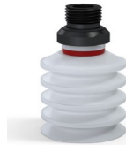
Variant reference: 92 40SLT 38D-2-GIC