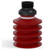
Variant reference: 92 40SL 38D-2-GIC