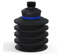
Variant reference: 92 50NI 14D-2-F