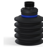
Variant reference: 92 50NI 38D-2-GIC