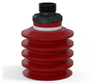
Variant reference: 92 50SL 38D-2-GIC