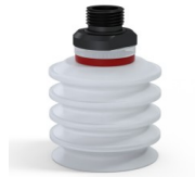
Variant reference: 92 50SLT 38D-2-GIC