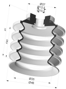
Bellows Suction Cup 4.5 folds Series 92, Ø 50 mm