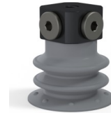
Variant reference: 96 25NR FM5BD