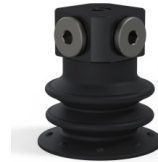
Variant reference: 96 25NI FM5BD