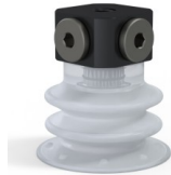
Variant reference: 96 25SLT FM5BD