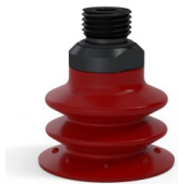
Variant reference: 96 35SL 14D-2-GIC