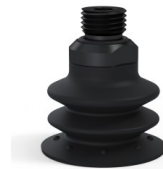
Variant reference: 96 35NI 14D-2-GIC