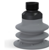
Variant reference: 96 35NR 14D-2-GIC