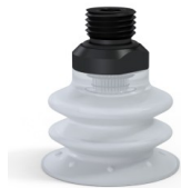
Variant reference: 96 35SLT 14D-2-GIC