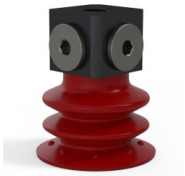
Variant reference: 96 35SL 18D-3-BD