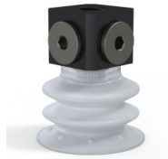
Variant reference: 96 35SLT 18D-3-BD