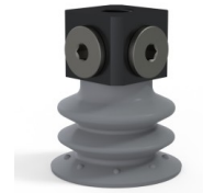
Variant reference: 96 35NR 18D-3-BD