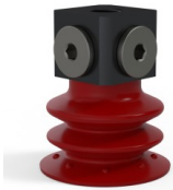
Variant reference: 96 35SL 18D-3-BD