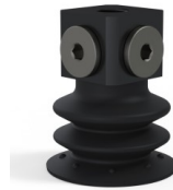
Variant reference: 96 35NI 18D-3-BD