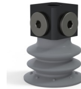
Variant reference: 96 35NR 18D-3-BD