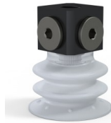
Variant reference: 96 35SLT 18D-3-BD