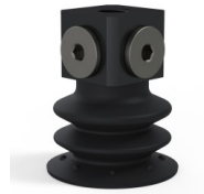
Variant reference: 96 35NI 18D-3-BD