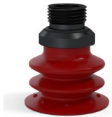
Variant reference: 96 35SL 38D-2