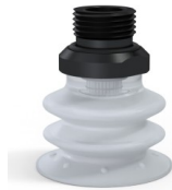
Variant reference: 96 35SLT 38D-2-GIC