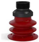
Variant reference: 96 35SL 38D-2-GIC