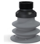
Variant reference: 96 35NR 38D-2-GIC