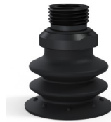
Variant reference: 96 35NI 38D-2-GIC