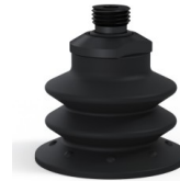
Variant reference: 96 52NI 14D-2-F