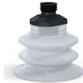
Variant reference: 96 52SLT 14D-2-F