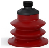
Variant reference: 96 52SL 14D-2-F