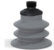
Variant reference: 96 52NR 14D-2-F