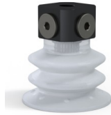
Variant reference: 96 52SLT 18D-3-BD