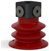
Variant reference: 96 52SL 18D-3-BD