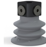
Variant reference: 96 52NR 18D-3-BD