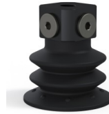
Variant reference: 96 52NI 18D-3-BD