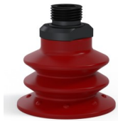
Variant reference: 96 52SL 38D-2-F